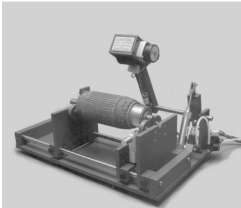
M200 base unit ready to test a 5hp traction motor